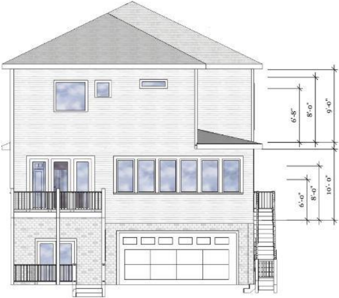
1 PROPOSED WEST ELEVATION A-08 SCALE: 1/8" = 1'-0" (1:96)