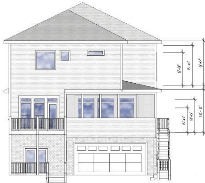
1 A-07 EXISTING WEST ELEVATION SCALE: 1/8" = 1'-0" (1.96)