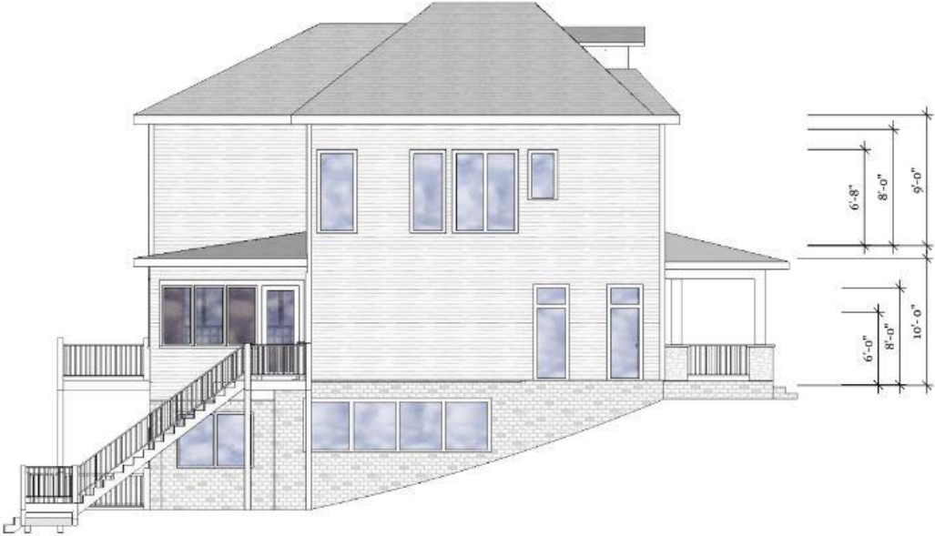
2 PROPOSED SOUTH ELEVATION A-08 SCALE: 1/8" = 1'-0" (1:96)