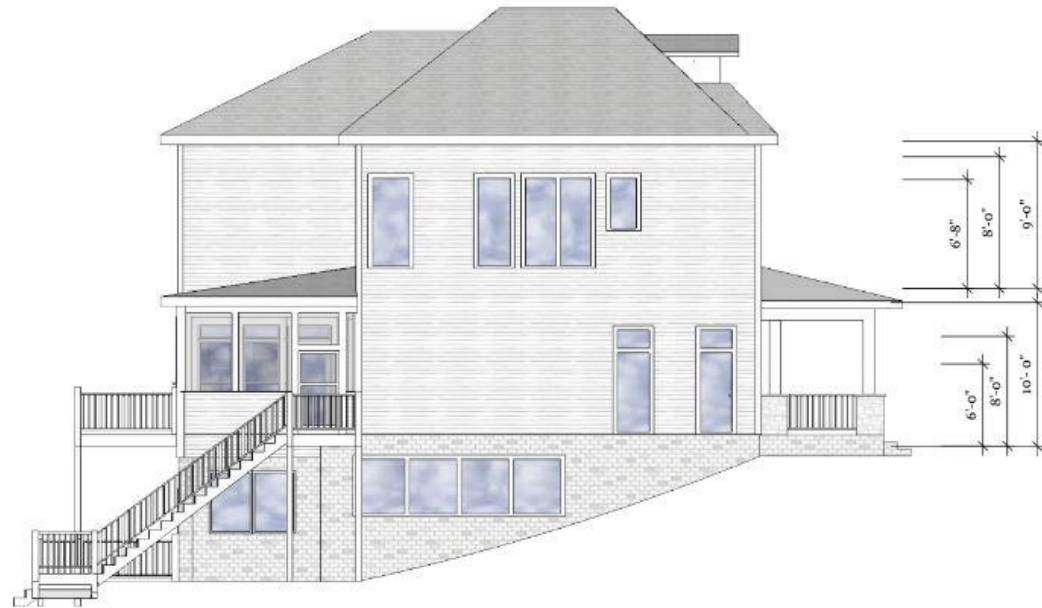
2 A-07 EXISTING SOUTH ELEVATION SCALE: 1/8" = 1'-0" (1.96)